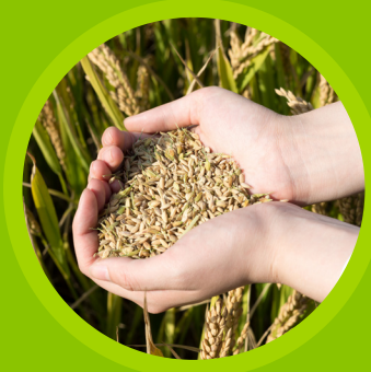
Solid grower connections

And with over 100 years of developing our deep market knowledge and robust infrastructure, we've nurtured customer trust by combining expertise across: