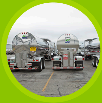
Strategically located manufacturing footprint and a coordinated supply chain