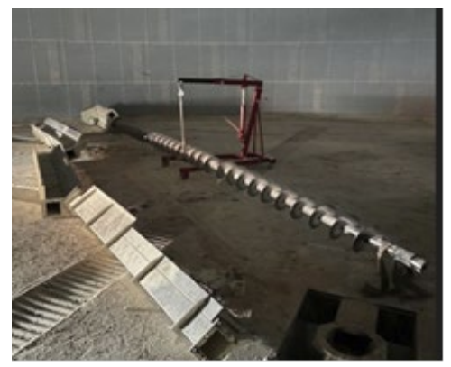
Ship loading capacity expected to increase by approximately 73 tones per hour