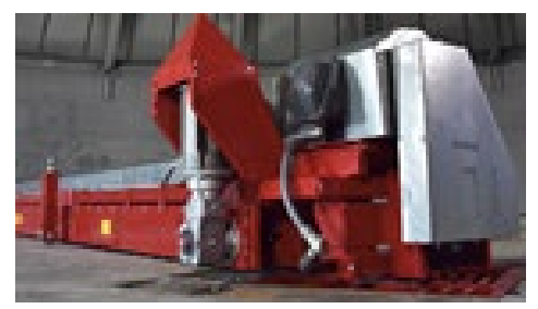
AGI EMEA selected to supply state-of-the-art grain handling equipment