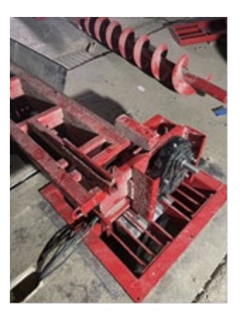
The new equipment to be delivered in Constanta in Sept. 2024