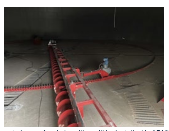
FThe 16 state-of-the-art pieces of grain handling will be installed in ADM's silos in Constanta