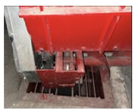
16 pieces of grain handling equipment to boost productivity in ADM's terminal