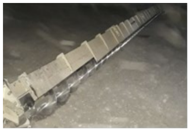
16 pieces of grin handling equipment will be replaced with more efficient ones