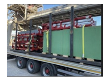
The first batch of grain handling equipment manufactured by AGI EMEA leaving for Romania