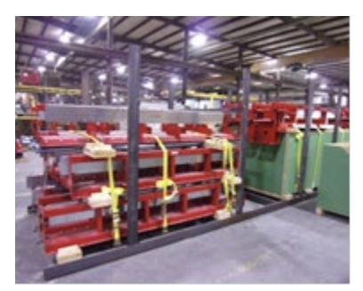
16 state-of-the-art pieces of grain handling equipment will be deployed in ADM's silos in the Port of Constanta